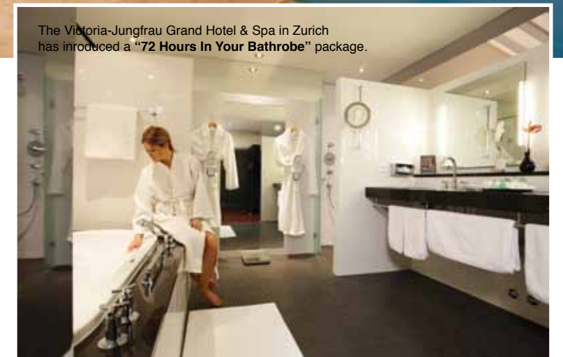
The Victoria-Jungfrau Grand Hotel & Spa in Zurich has introduced a "72 Hours In Your Bathrobe" package.

The Twelve Apostles Hotel in Cape Town just completed a major makeover of its celebrated Spa that now glistens with an all-white crystal grotto interior, seven treatment rooms, Rasul chamber for traditional steam and mud cleansing rituals, Lanyana Aromatherm room for hydrotherapy or Vichy showers, and nail salon. Coinciding with the relaunch is the introduction of B|Africa, a new line of signature spa products produced from natural ingredients without synthetic pesticides, fertilizers or animal testing. This internationally-renowned, five-star South African hideaway overlooking the Atlantic is just 15 minutes from Cape Town. In addition to the award-winning health and beauty spa, two pools perched above the ocean, two restaurants, bar lounge, and 16-seat private cinema (with popcorn, of course) complete the 70-room property. Complimentary