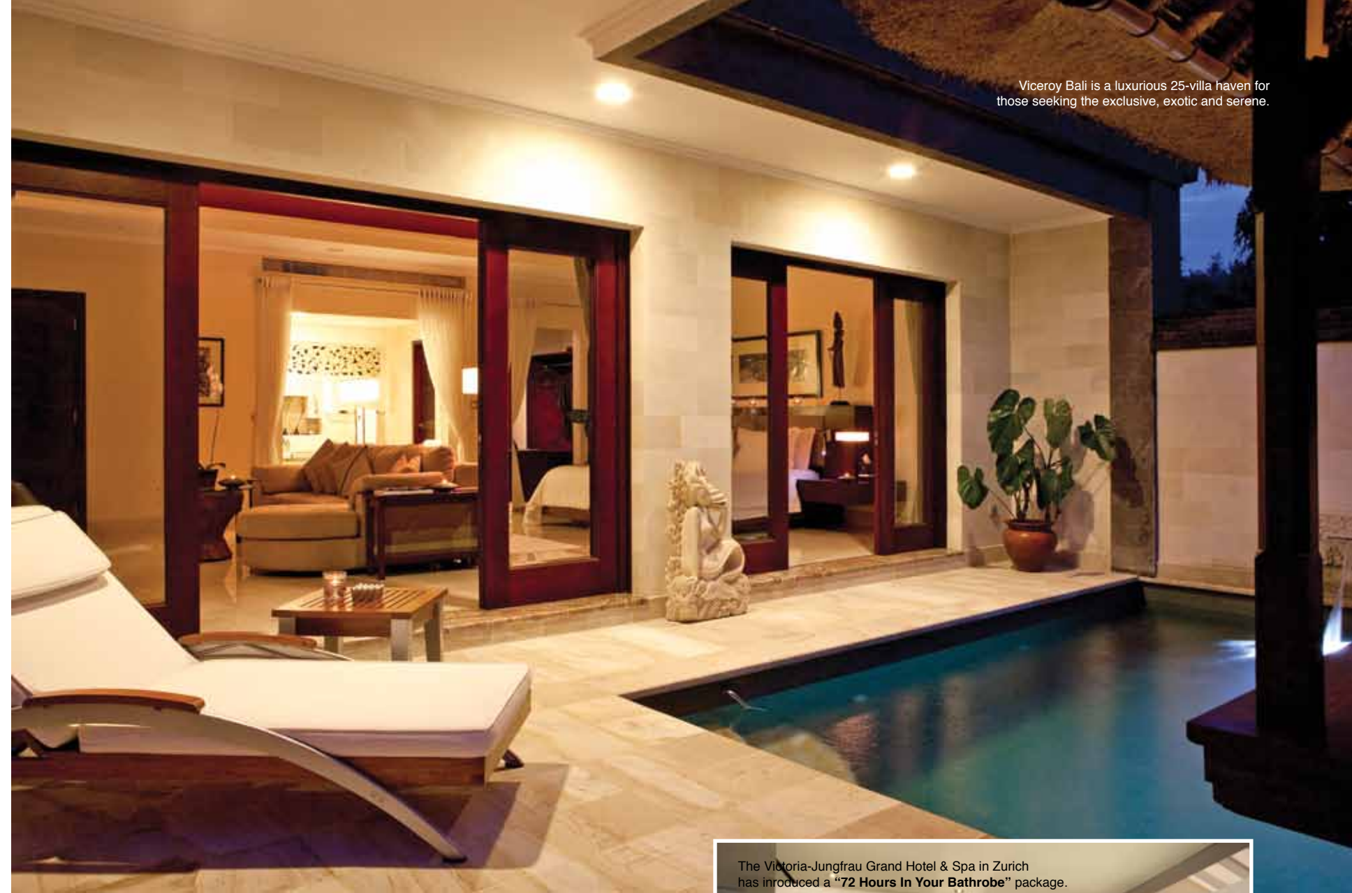
Viceroy Bali is a luxurious 25-villa haven for those seeking the exclusive, exotic and serene.

Napa Truffle Festival , January 13-16. For discerning gourmands, wine lovers, and growers, the second annual Napa Truffle Festival will feature an interesting gathering of leading truffle cultivation experts and scientists, food and wine experts, and internationally-renowned chefs. Program includes food and wine pairings, truffle orchard excursions and a Truffles & Wine dinner prepared by Michelin Star chefs. Keynote speaker is Barbara Fairchild, former editor of Bon Appétit . Two days of culinary and scientific programs, winery lunches, V.I.P. winery tastings and local truffle orchard tours, complete with truffle dogs, culminate with the Saturday Night Truffles & Wine Dinner, hosted by Michelin Star Chef Ken Frank of La Toque which features a multi-course truffle menu and wine pairing, each course being prepared by a different Michelin Star chef including Michael Cimarusti of Providence in Los Angeles; Suzette Gresham-Tognetti of Acquerello in San Francisco; Marco Gubbiotti of La Bastiglia