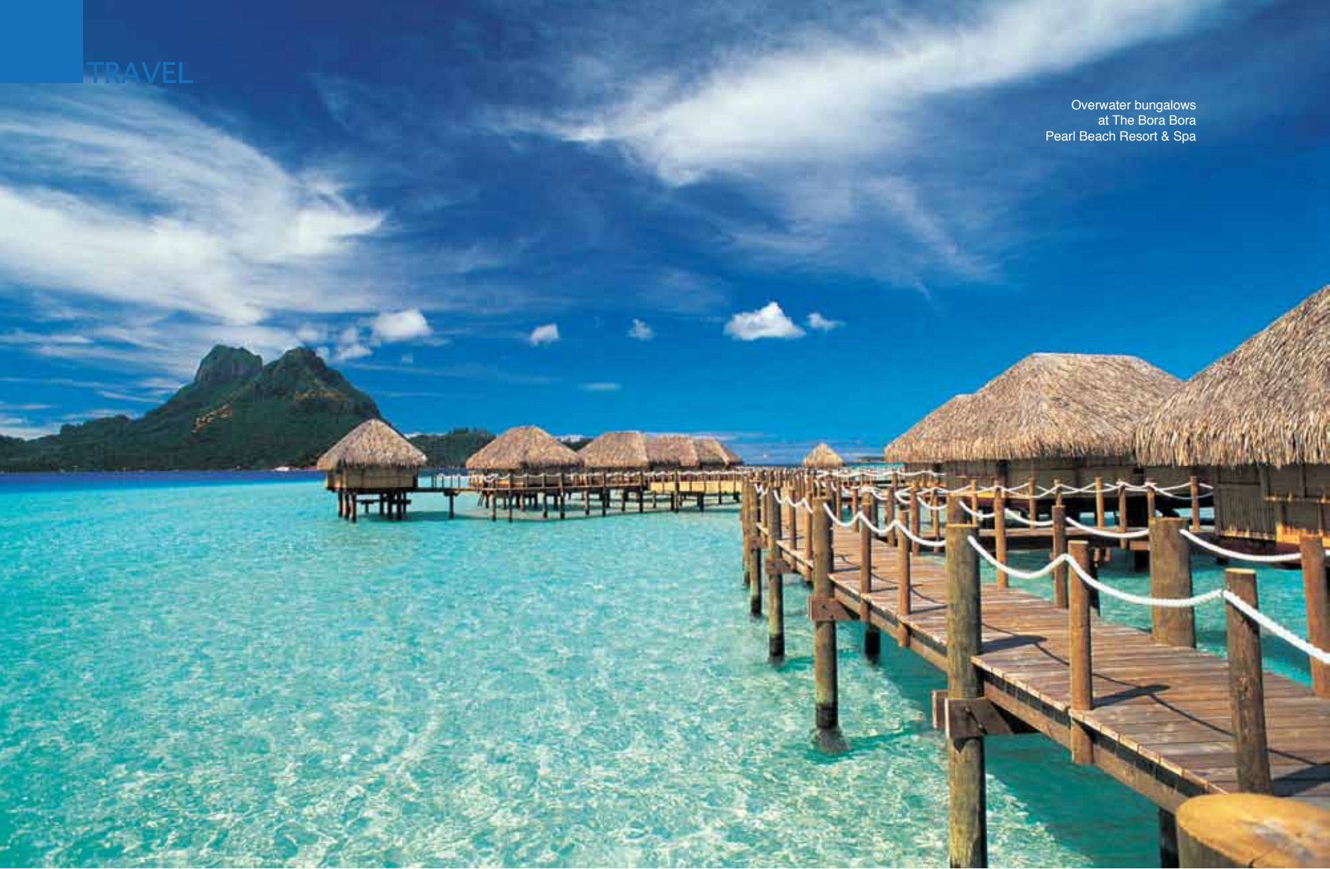
Overwater bungalows at The Bora Bora Pearl Beach Resort & Spa