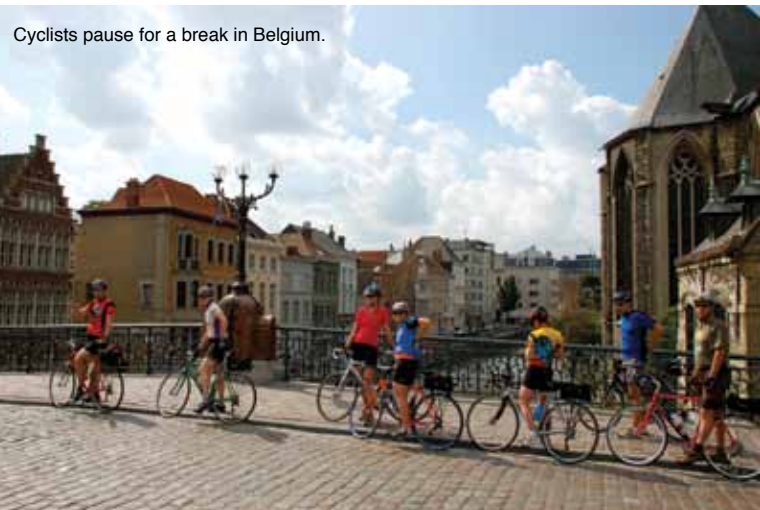
Cyclists pause for a break in Belgium.

Book now, enjoy later. Travel offers a terrific potpourri of great gift ideas. Happy Holidays and Bon Voyage! ❄️