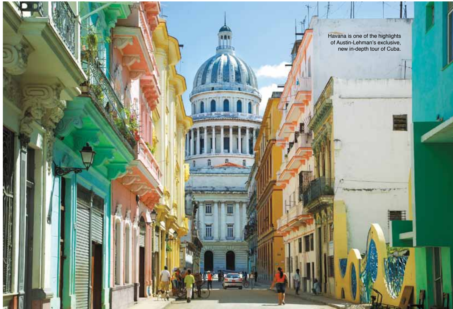
Havana is one of the highlights of Austin-Lehman's exclusive, new in-depth tour of Cuba.

de los Portales, Che Guevara's headquarters during the Cuban Missile Crisis. For advance information, call 1-800-575-1540 or e-mail info@austinlehman.com . For current trips, log onto www.austinlehman.com .